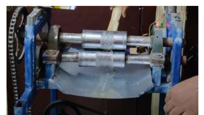
Fig 2. Detailed and Exploded Design of Sugarcane Juice Extracting Machine

Capacity (Throughput) of Machine was based on the ability of the machine to extract sugarcane juice of duration of time per kilogram weight of the Sugarcane.